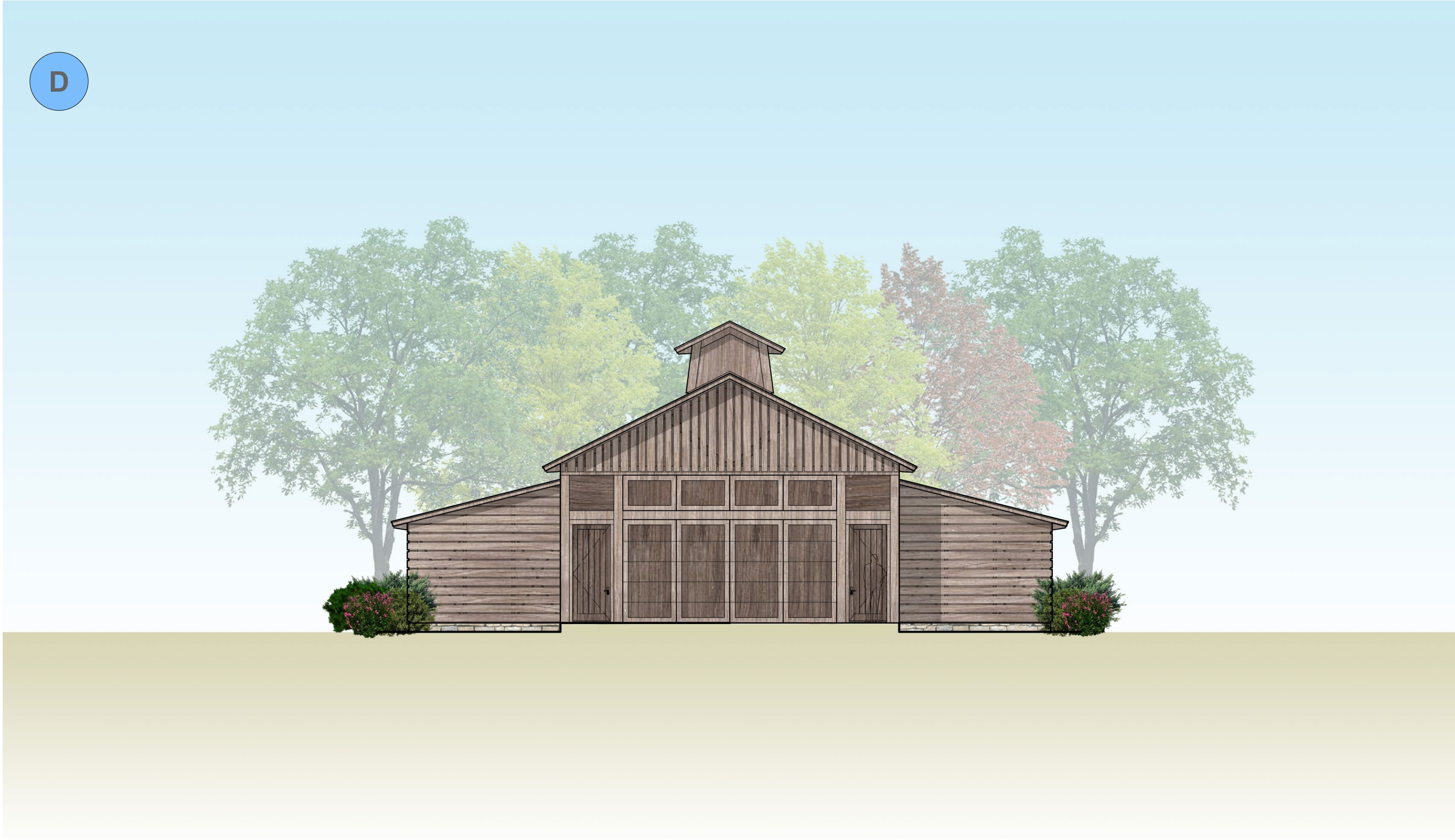
PARKING BARN - ENTRY ELEVATION