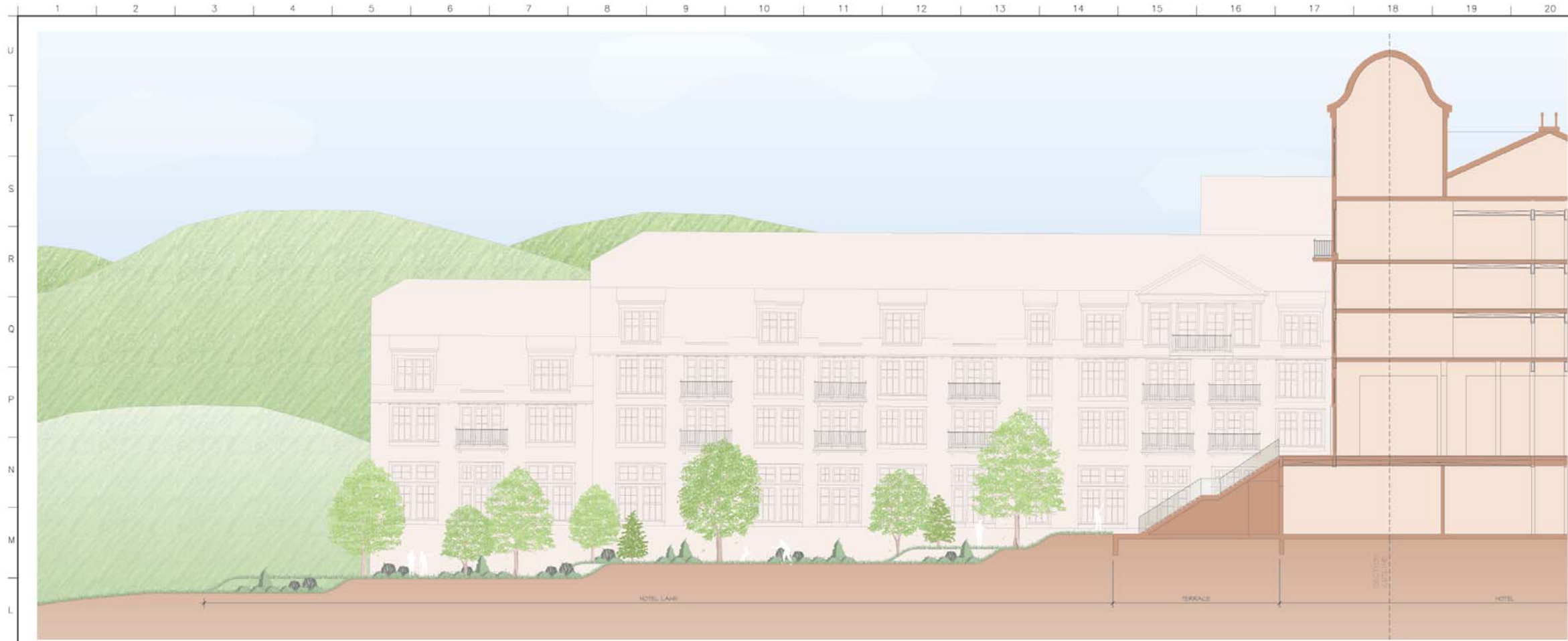
K1 SECTION THROUGH HOTEL LAWN & GARDENS SCALE: 1/8" = 1'-0"