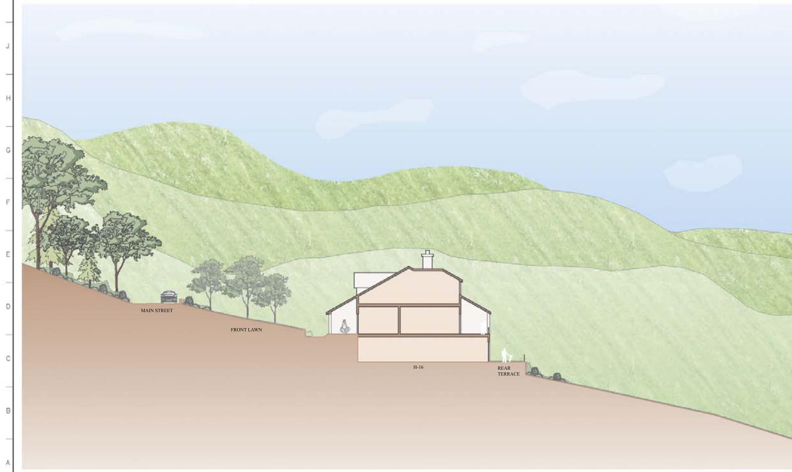
SECTION SCALE: 1/8" = 1'-0"