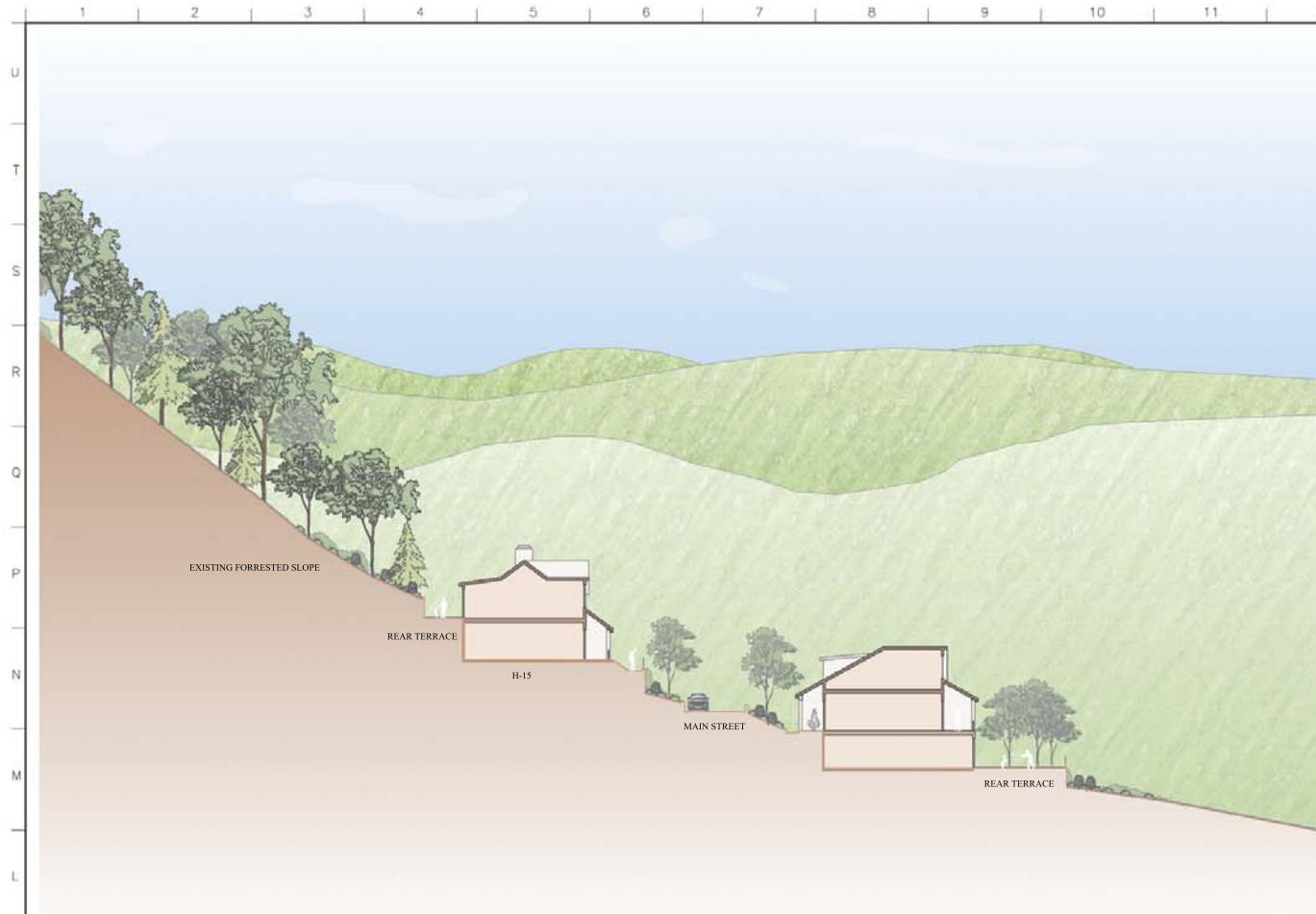
SECTION THROUGH HILLSIDE ESTATE HOMES SCALE: 1/8" = 1'-0"