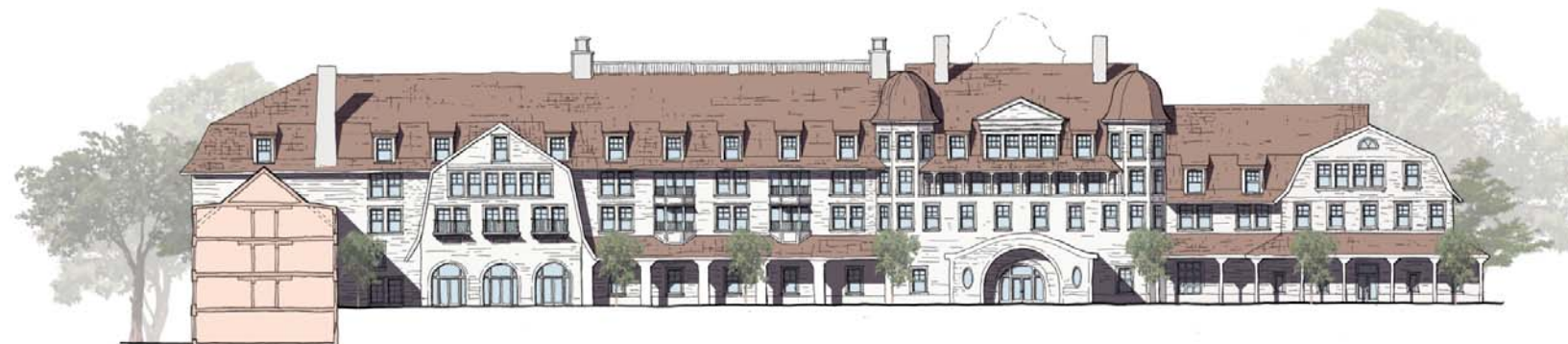
② HOTEL NORTH ELEVATION: BUILDING R-1 SCALE: 1/16"=1'-0"