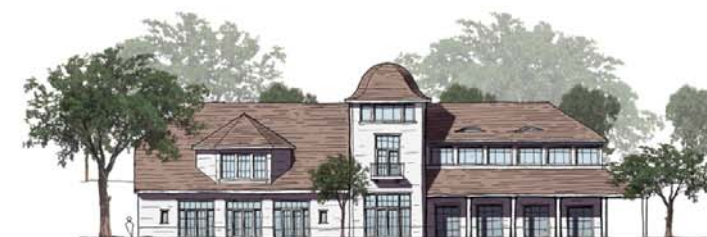
④ CONFERENCE CENTER SOUTH ELEVATION: BUILDING R-3 SCALE: 1/16"=1'-0"