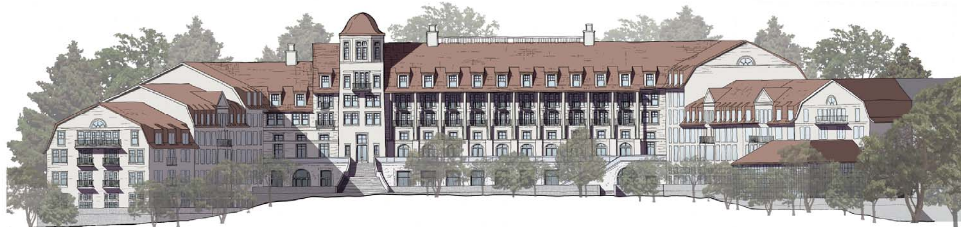
① HOTEL SOUTH ELEVATION: BUILDING R-1 SCALE: 1/16"=1'-0"