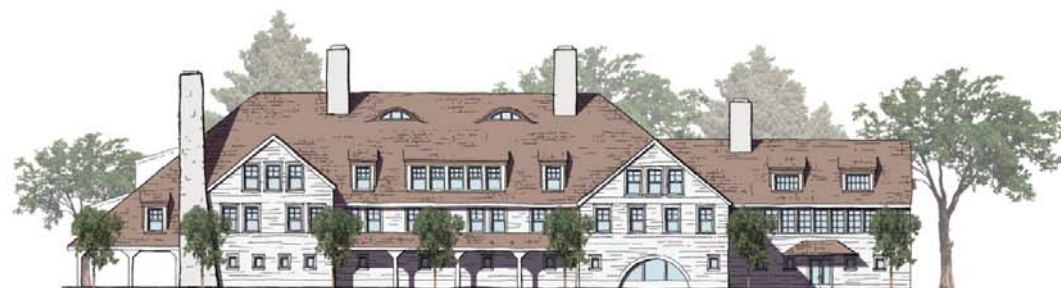
③ SPA WEST ELEVATION: BUILDING R-2 SCALE: 1/16"=1'-0"