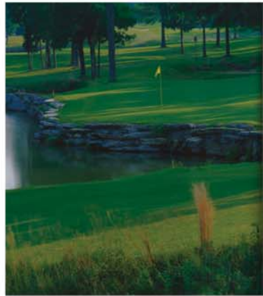
Stone Wall, Honors Course, TN—Golf Course "Rough"