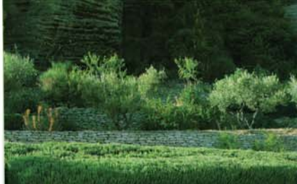
Personal Terraced Garden—Service Area