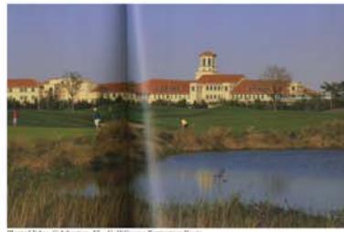
Planted Edge, Celebration, FL—Golf Course Estimation Basin