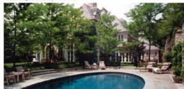
North York Residence, Ontario—Hotel Pool