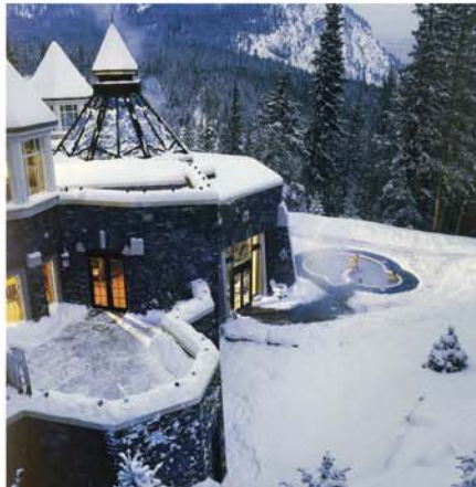
Farmstead Bath Springs Hotel, Canada—Spa Pool