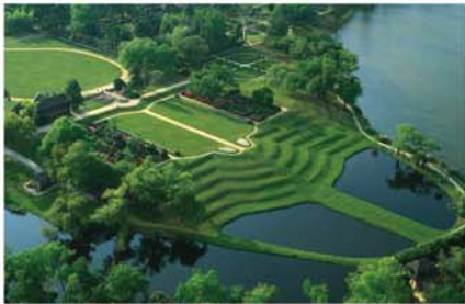
Terraces, Middleton Place Plantation, SC—Hotel South Lawn