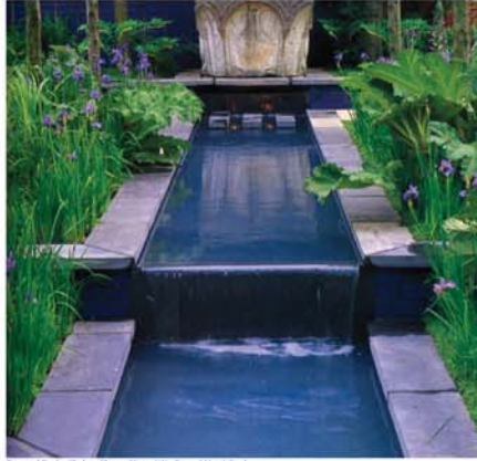
Terraced Pool, Chelsea Flower Show, UK—Formal Hotel Garden