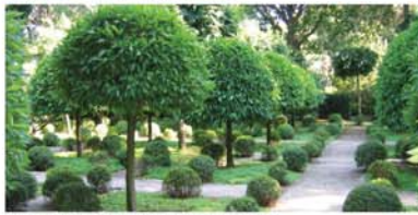
Geometric Topiary Garden, with Deciduous Balls—Formal Hotel Garden