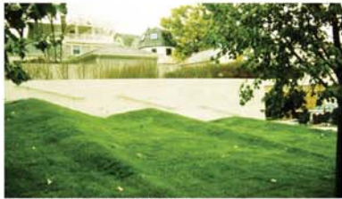
Dayton Residence Terraces, Minneapolis, MN—Hotel South Lawn