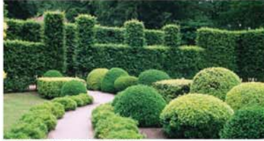
Mixed Topiary Garden, Jacques Witte—Formal Hotel Garden