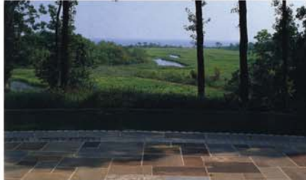
Bluestone Paving and Gardens—Hotel Terrace at South Lawn