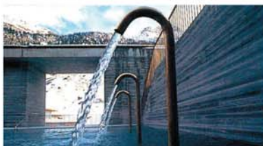
Terra Vals, Vals, Switzerland—Spa Pool