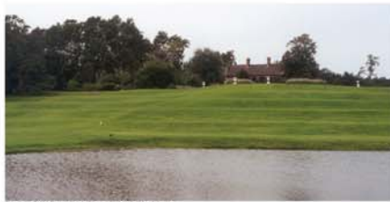
Terraces, Middleton Place Plantation, SC—Hotel Lawn