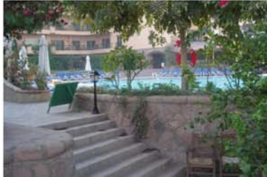
Seaboard Golf Resort, Egg Harbor Pool