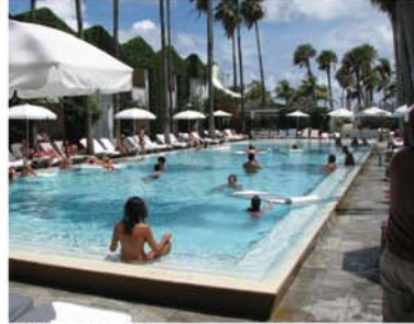
Delano Hotel, Miami, FL—Hotel Pool