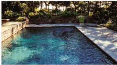
Pool with Stone Platform—Spa Pool