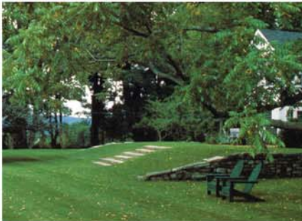
Bluestone Steps in Lawn—Hotel South Lawn