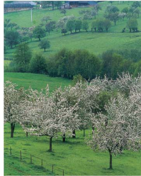
Orchard, Aaga, Linnos