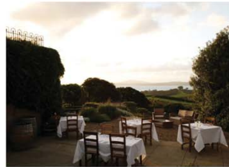
Outdoor Dining, Madrick Island Waikato Island, New Zealand