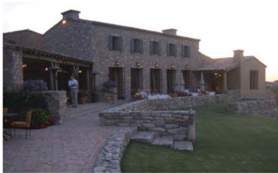
Outdoor Dining, Silverleaf Chateau, AZ