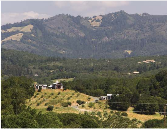
View, Glen Ellen, CA