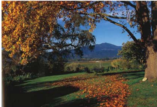
View of Distant Hills and Valley--Winery Lanes