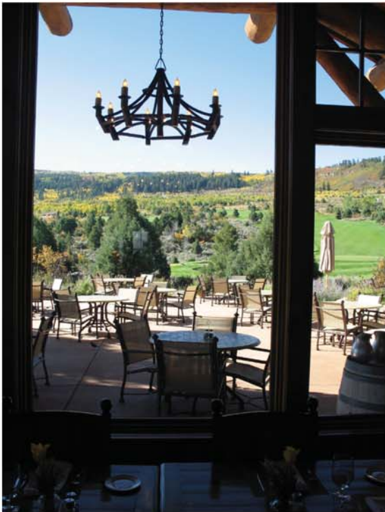
Interior & Exterior Seating With View Red Sky Golf Club House, CO