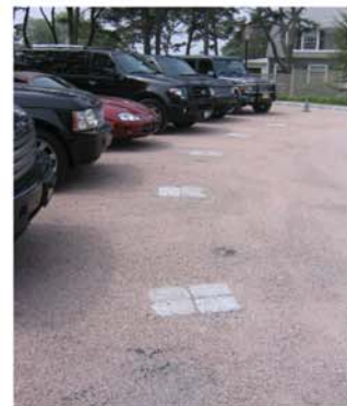
Gravel Parking with Paving Detail, Cape Cod-Winery Parking Lot