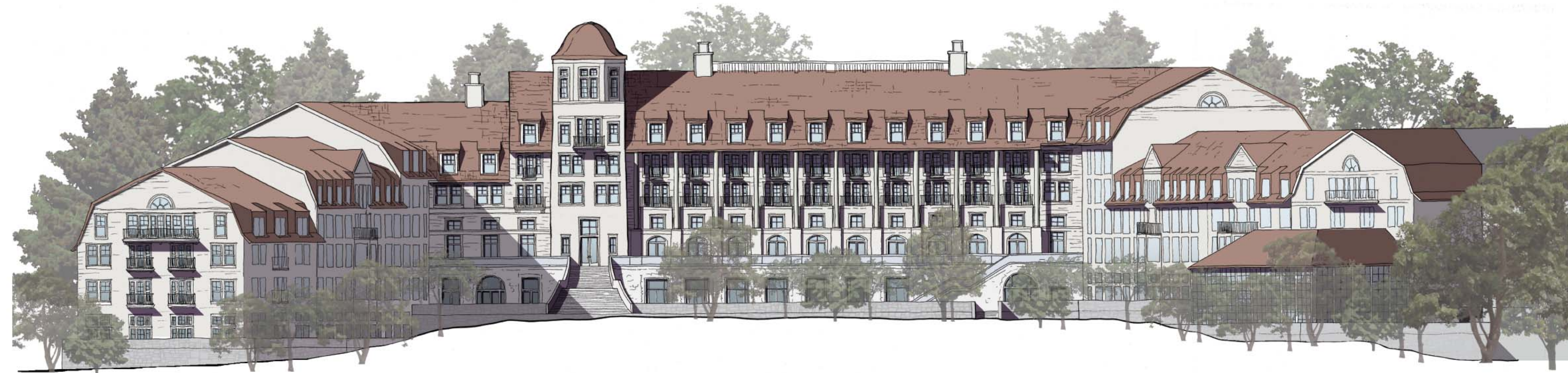
1 HOTEL SOUTH ELEVATION: BUILDING R-1 SCALE: 1/16"=1'-0"