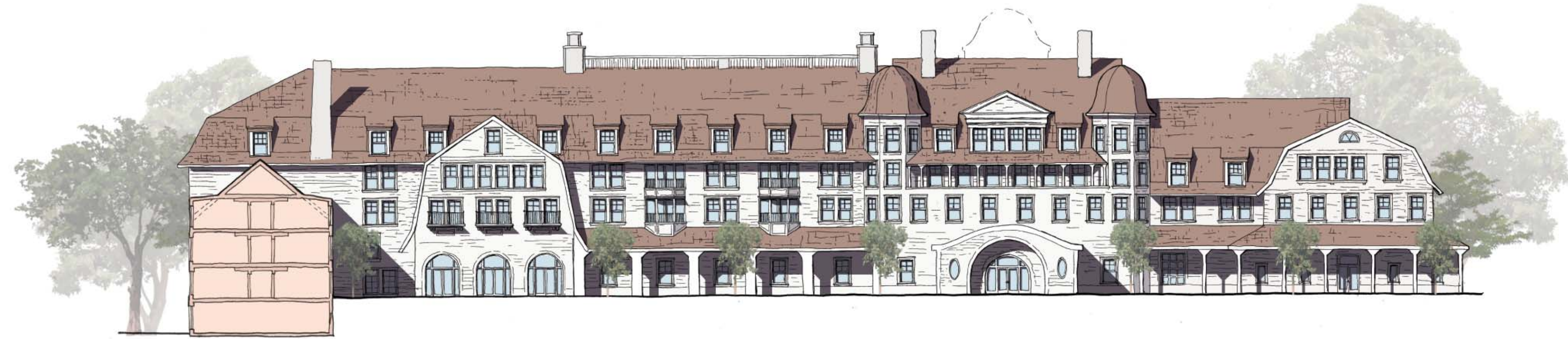
2 HOTEL NORTH ELEVATION: BUILDING R-1 SCALE: 1/16"=1'-0"