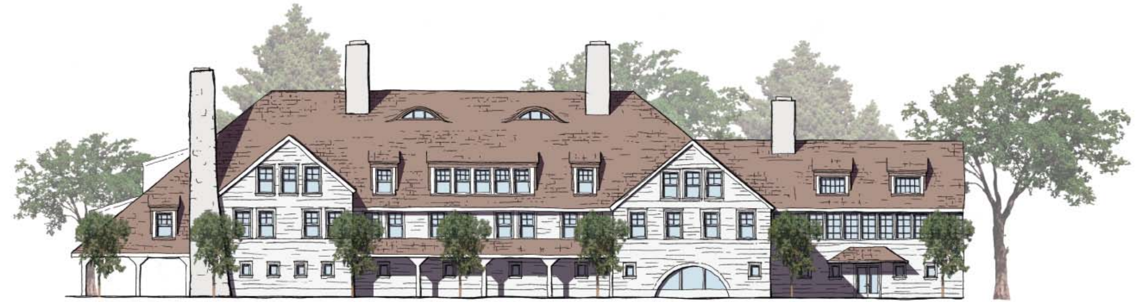
3 WEST ELEVATION: BUILDING R-2 SCALE: 1/16"=1'-0"