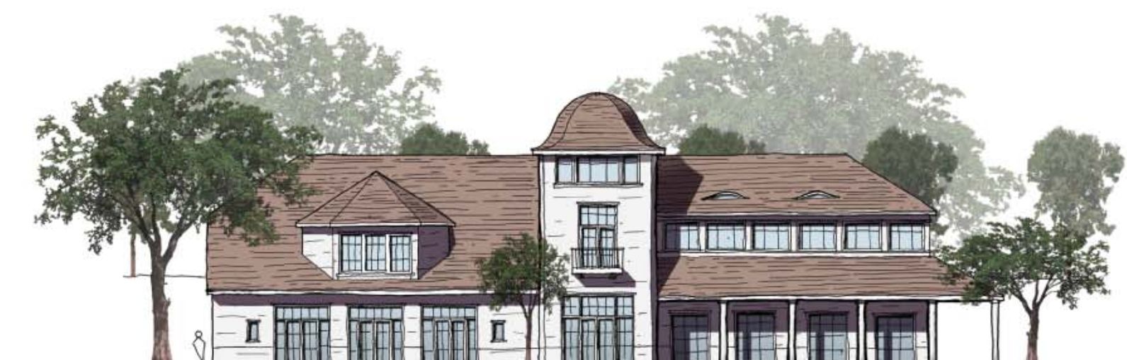
4 SPA SOUTH ELEVATION: BUILDING R-3 SCALE: 1/16"=1'-0"