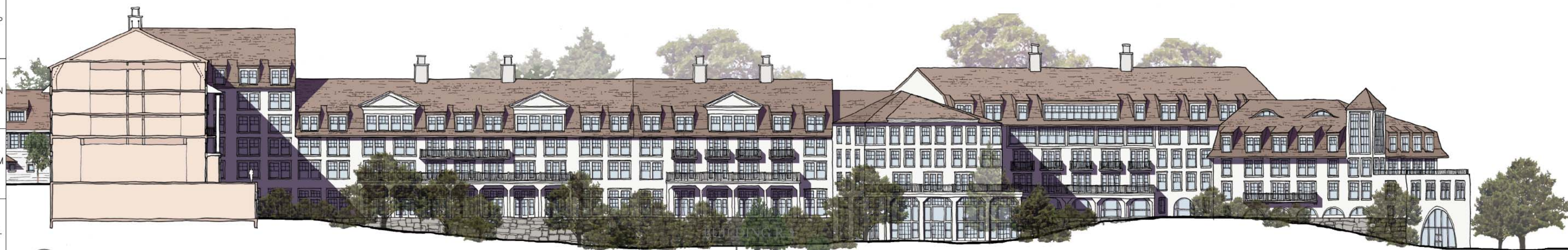
2 HOTEL WEST ELEVATION SCALE: 1/32"=1'-0"