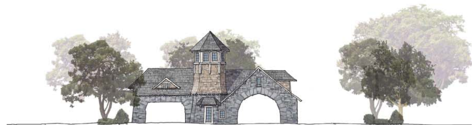
3 WELCOME HOUSE EAST ELEVATION SCALE: 1/16"=1'-0"