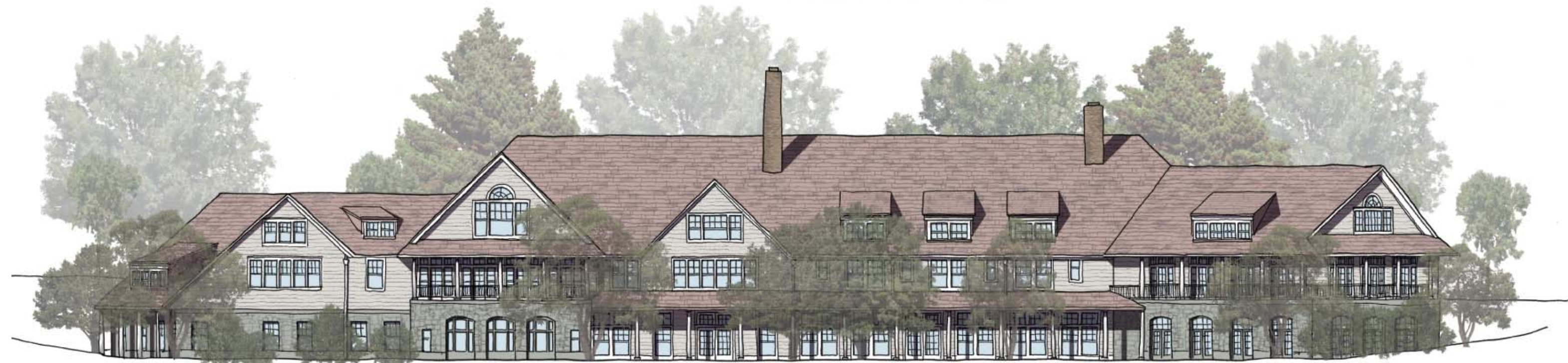
1 CLUBHOUSE SOUTH ELEVATION SCALE: 1/16"=1'-0"