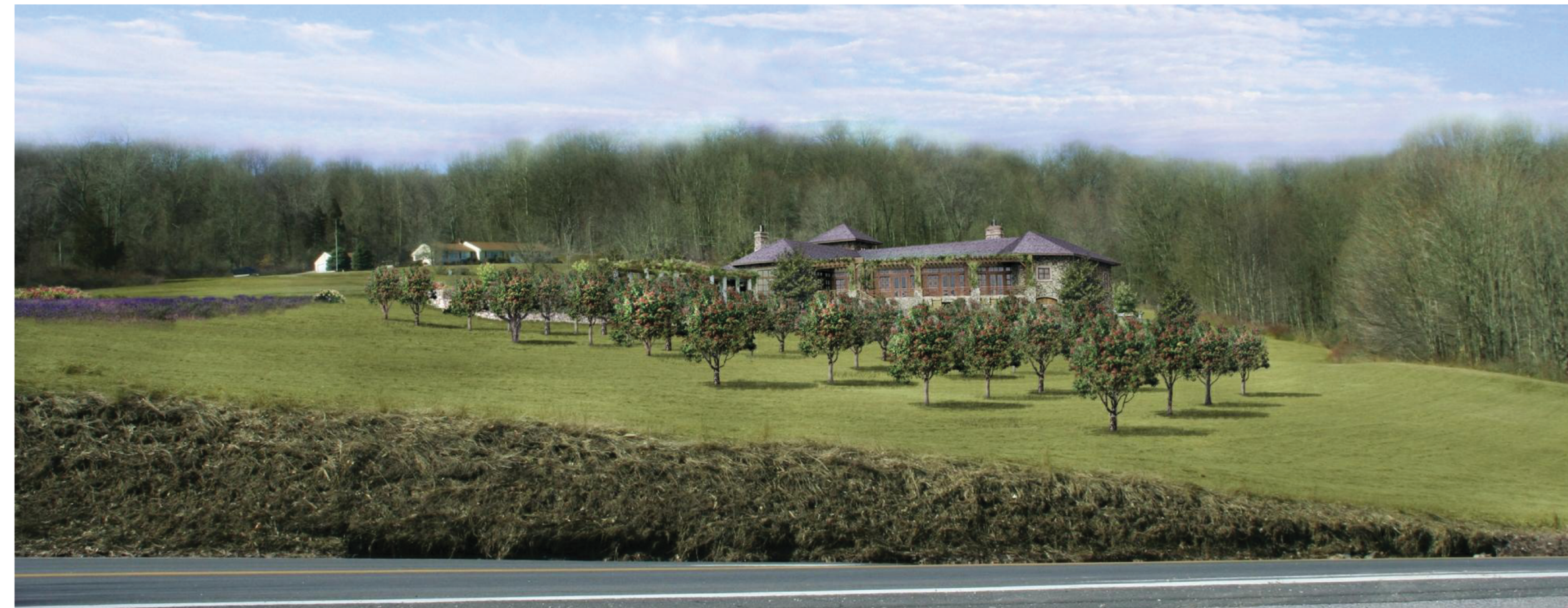
PERSPECTIVE LOOKING NORTH