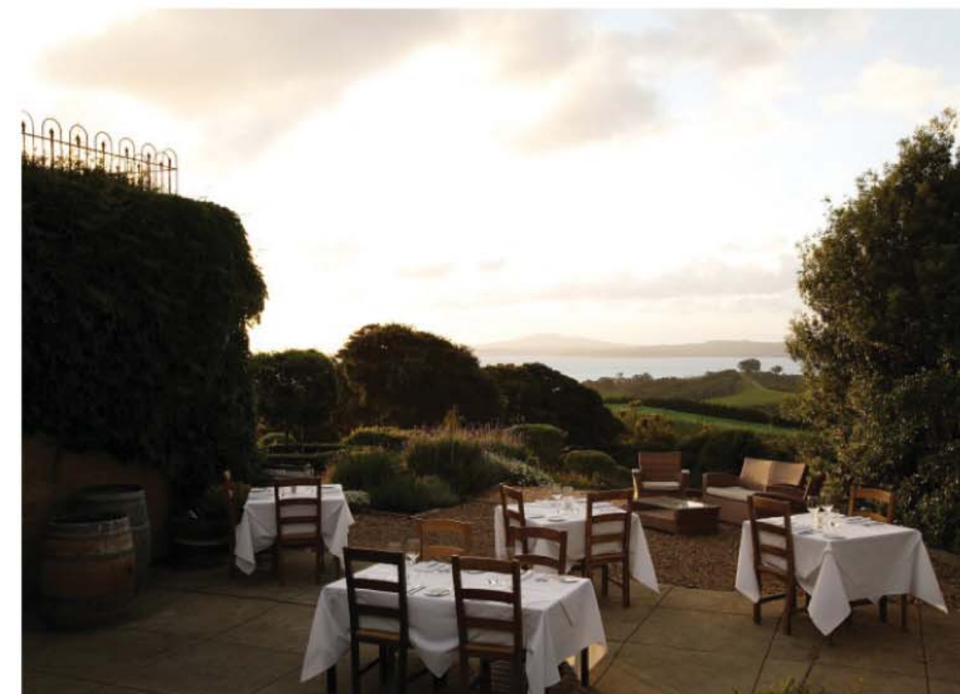
Outdoor Dining, Mudbrick Island Waiteke Island, New Zealand