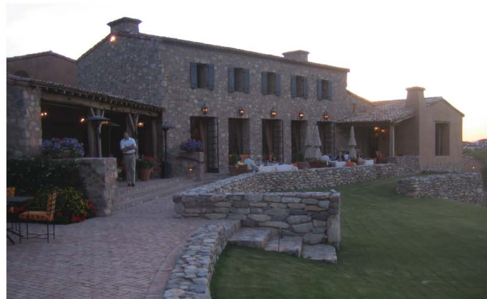
Outdoor Dining, Silverleaf Clubhouse, AZ