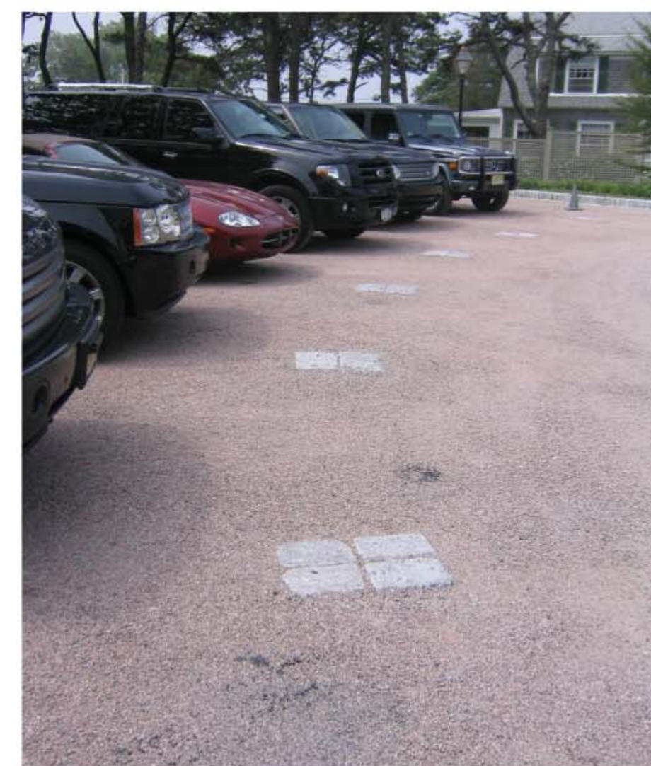
Gravel Parking with Paving Detail, Cape Cod--Winery Parking Lot