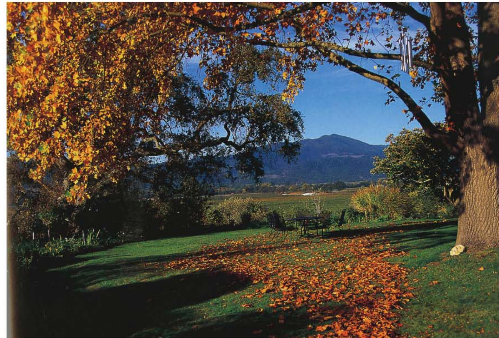
View of Distant Hills and Valley--Winery Lawn