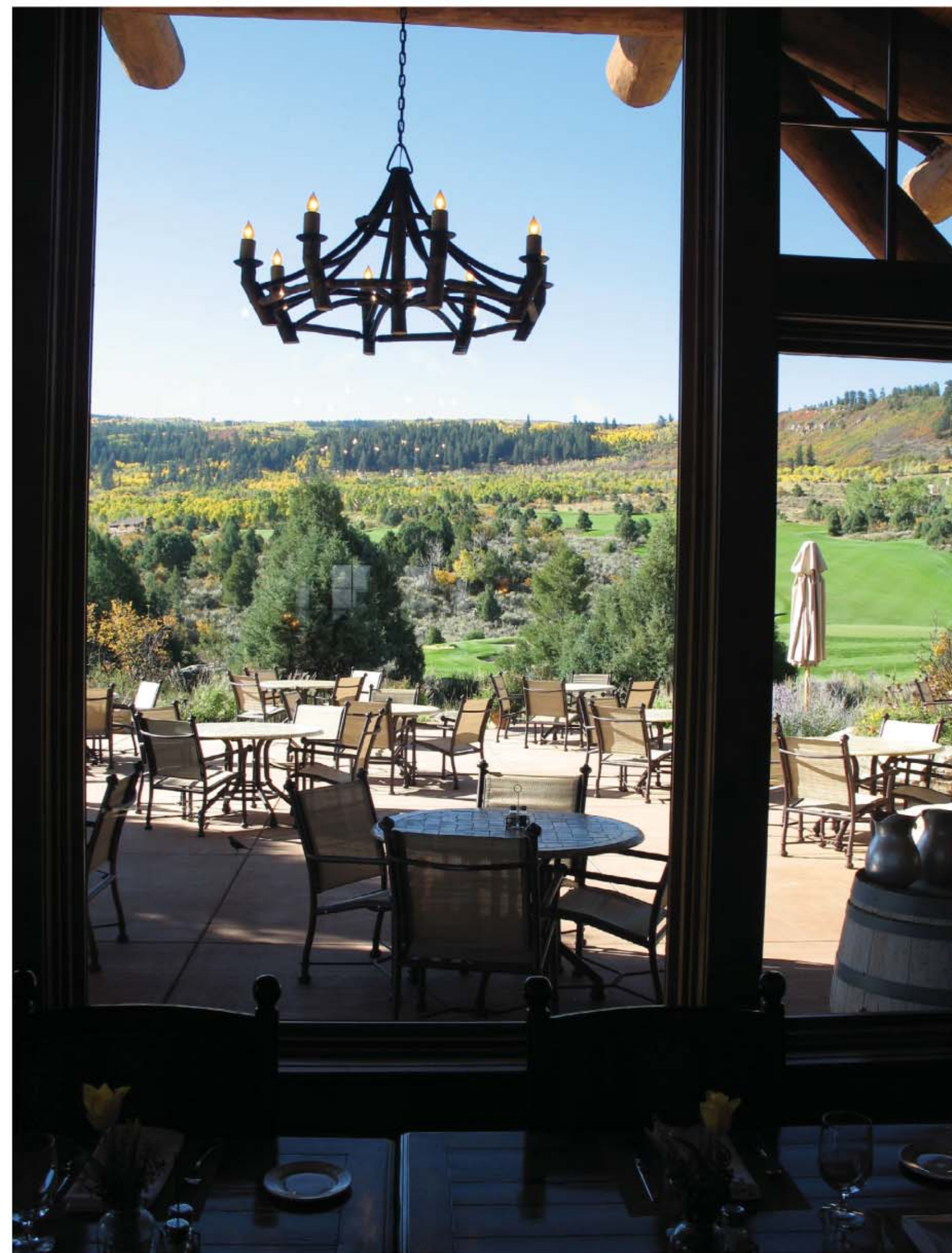
Interior & Exterior Seating With View Red Sky Golf Club House, CO