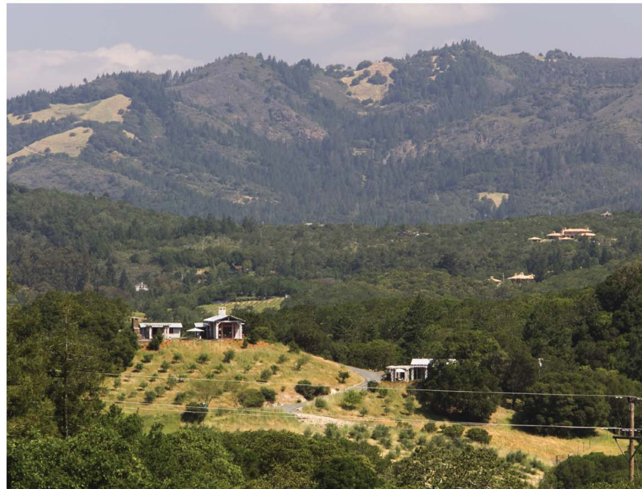
View, Glen Ellen, CA