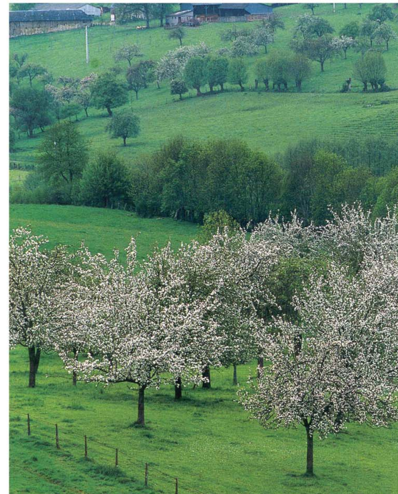
Orchard, Auge, Liseux