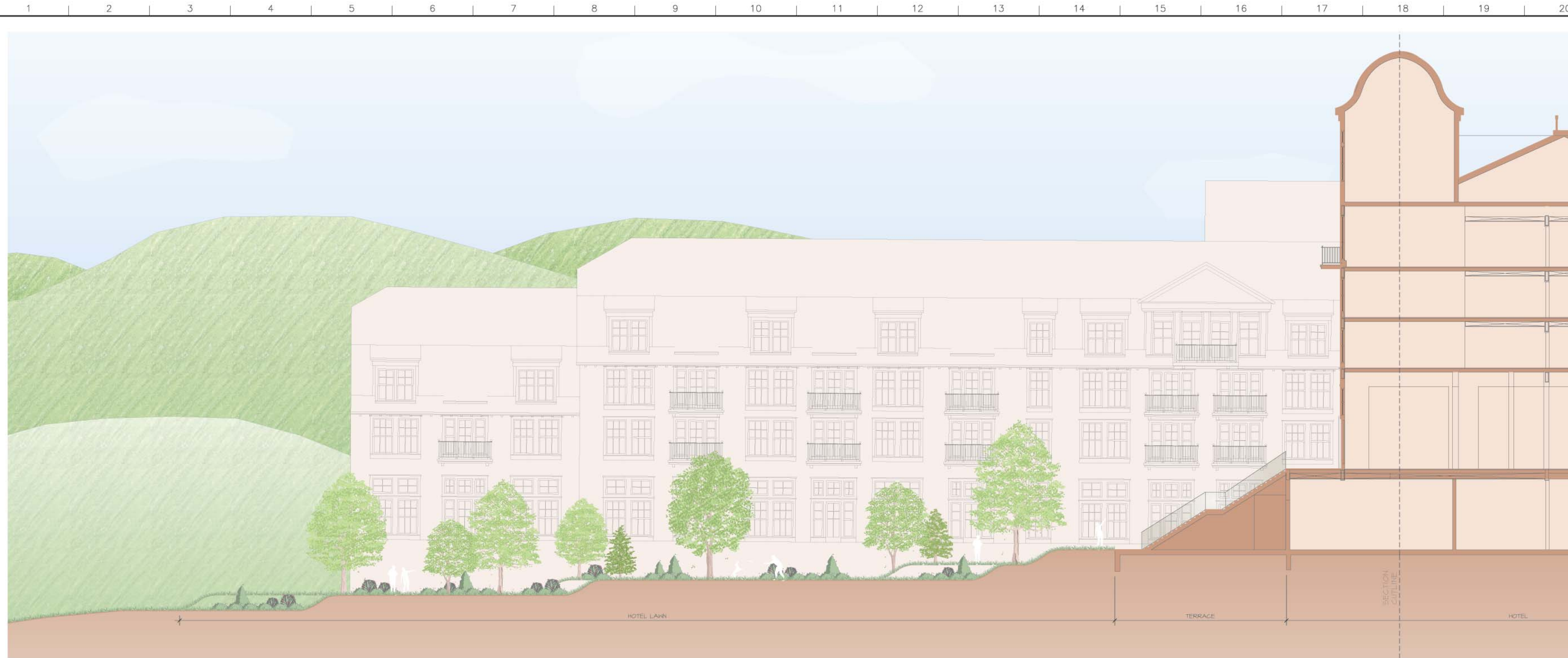
K1 SECTION THROUGH HOTEL LAWN & GARDENS SCALE: 1/8" = 1'-0"