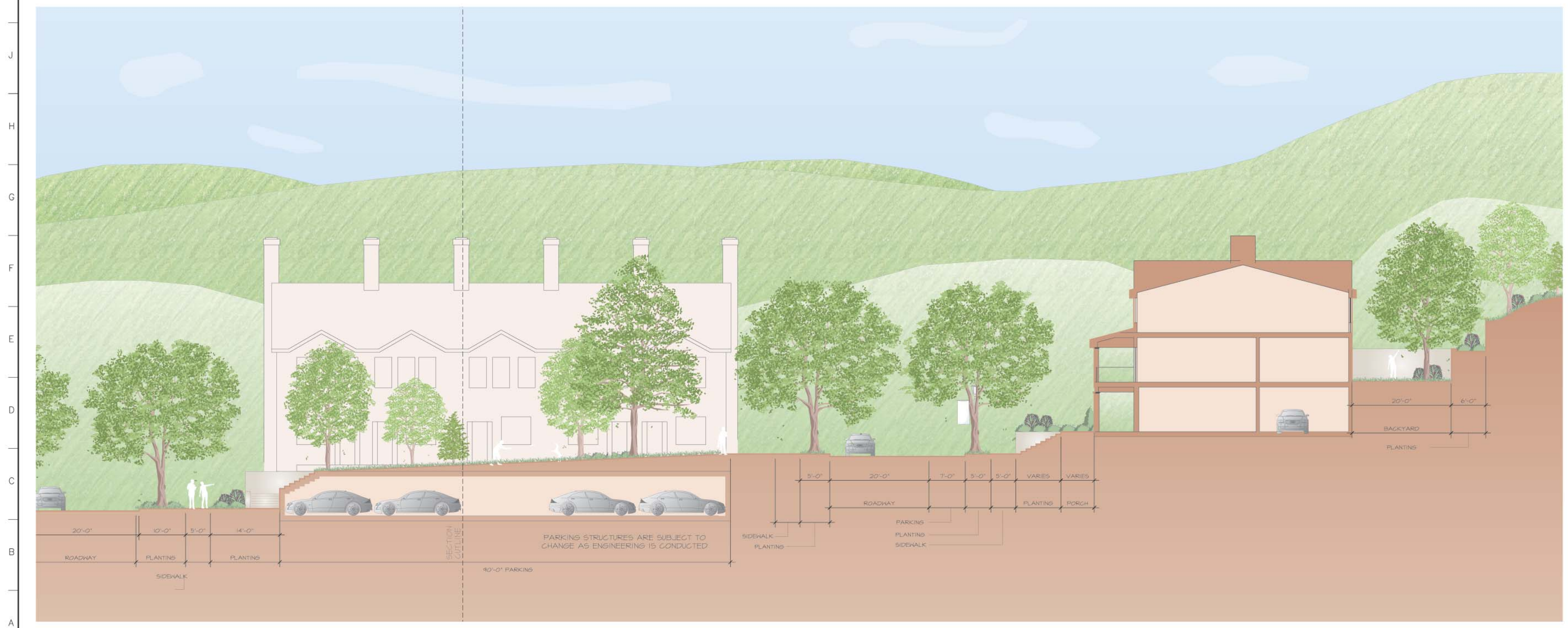
A1 SECTION THROUGH SCALE: 1/8" = 1'-0"