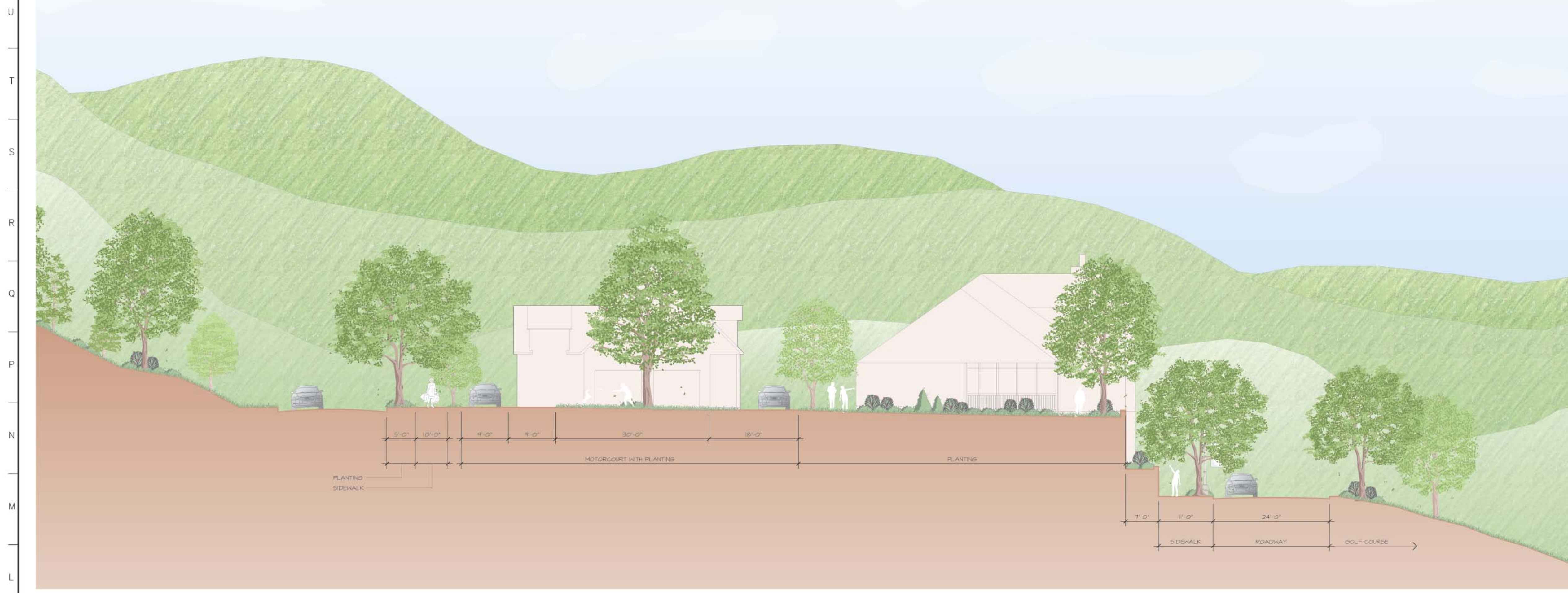
K1 SECTION THROUGH GOLF VILLAS SCALE: 1/8" = 1'-0"