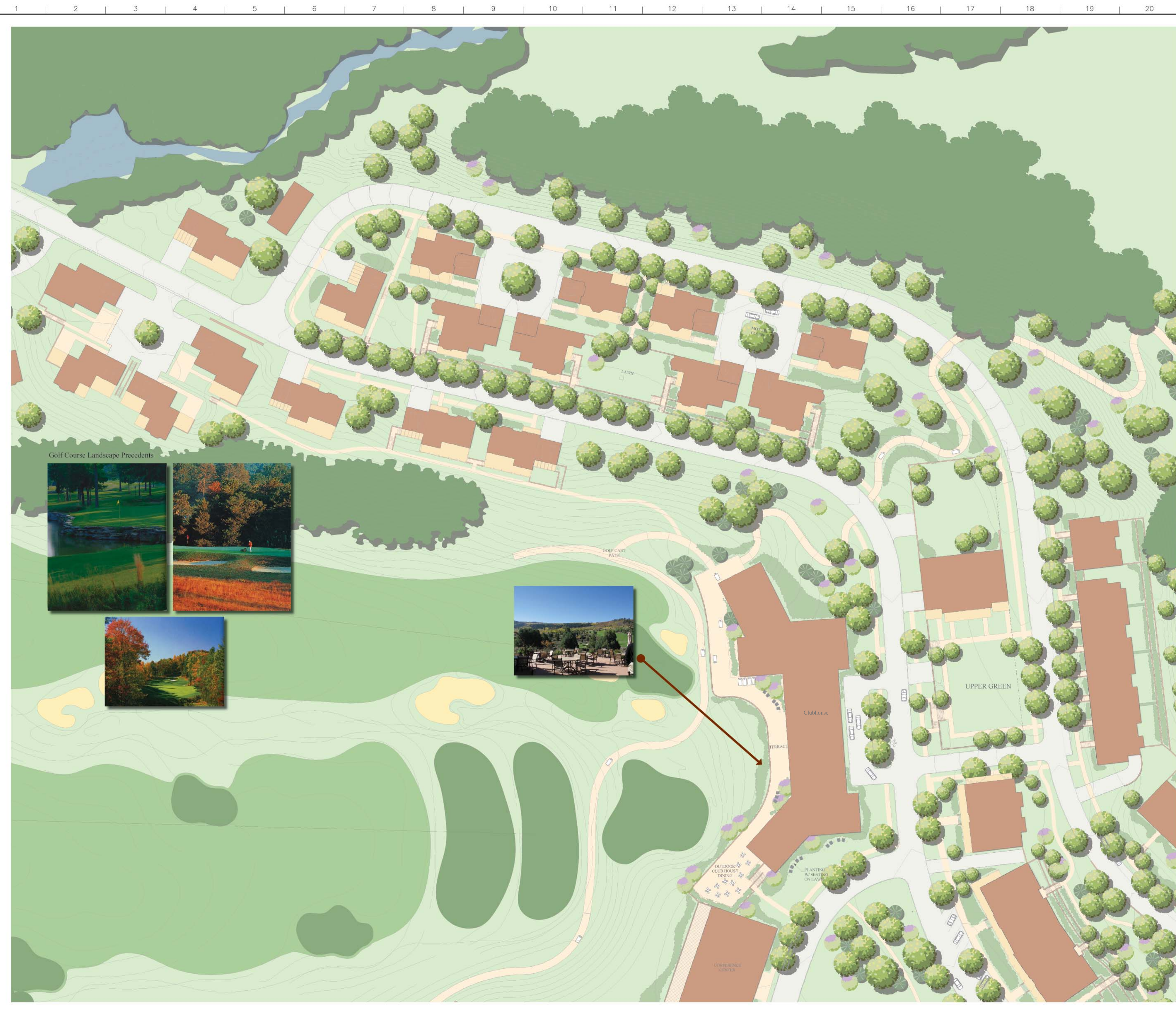
Golf Course Landscape Precedents