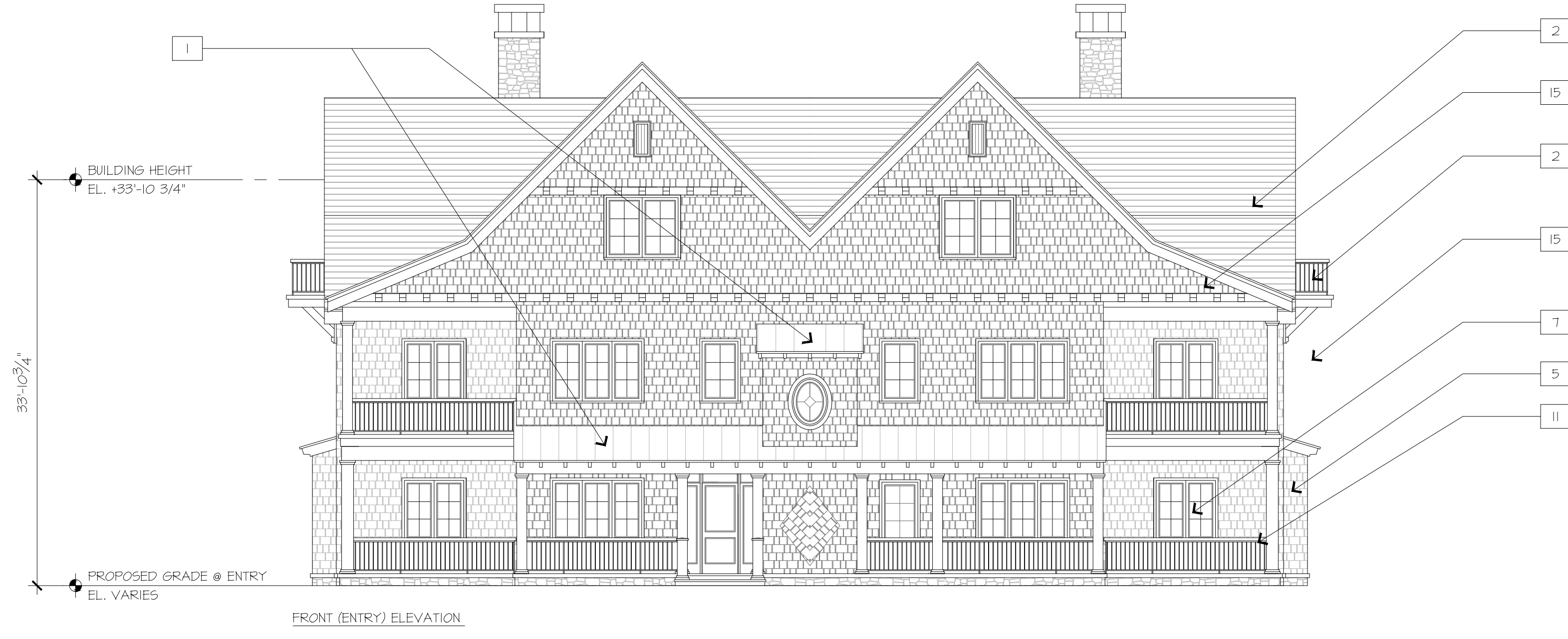
FRONT (ENTRY) ELEVATION