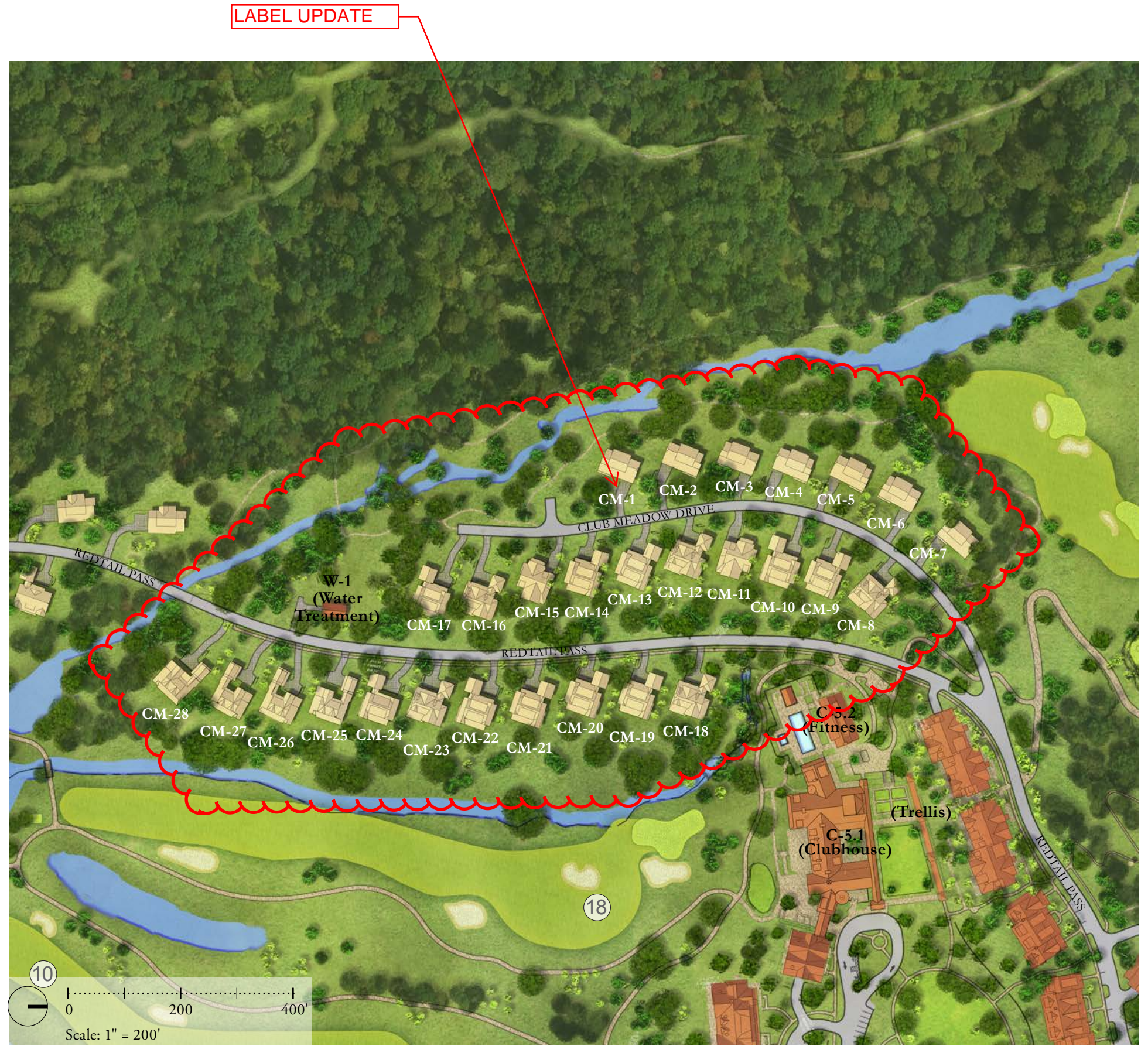
GOLF VILLAS NEIGHBORHOOD